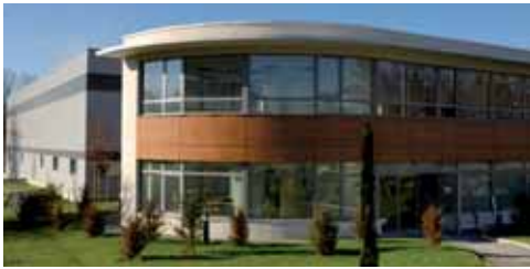
Juvéderm® ULTRA manufacturing facility in France

Patient satisfaction is at the heart of our research and development. We have the treatments, devices and professional support to help practitioners offer patients the natural look they want.